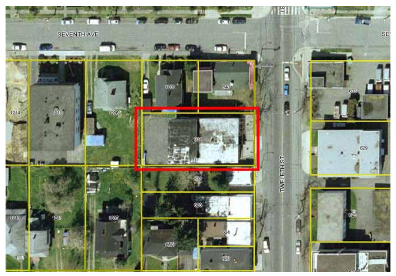
634 Twelfth Street, New Westminster, BC

The subject property is rectangular in shape with a 61.8 foot frontage on Twelfth Street and a depth of 132 feet for a total area of 8,157.6 square feet.